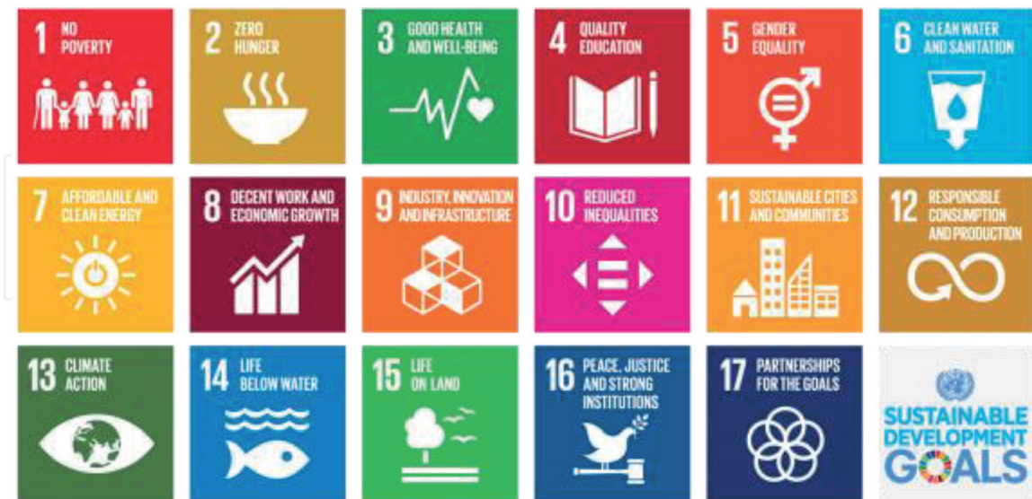
Figure 2. The United Nation's 17 SDGs [82].

and leading sustainability activists collectively calling on governments, economies and the business sector to gear up for a decade of action and delivery on issues of sustainable development [83].