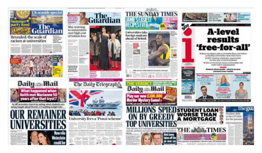
Fig. 2.1 Newspaper headlines attacking universities in the UK

period of populism that is characterising the UK, but is also justified due to the generation-long mismanagement of UK universities.<sup>14</sup>