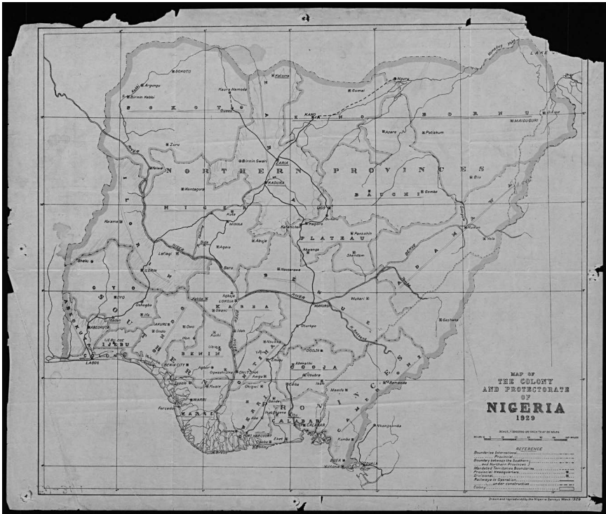
Figure 7.1 Map of the Colony and Protectorate of Nigeria 1929